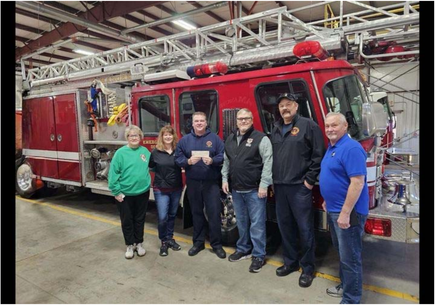
We received a $2,000 donation from Brent Firehouse Coffee, LLC to purchase nozzles and other equipment for the Ladder Truck.